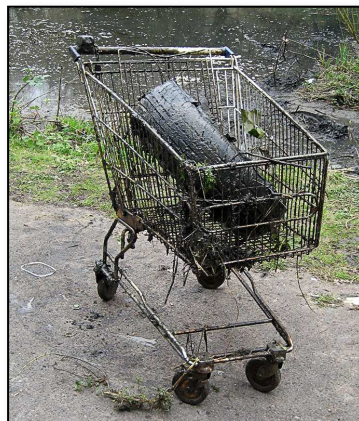
Risen from the depths

Finally we reached the interceptor near Hartcliffe Way. This was a particularly bad area, not just the interceptor itself, but all around it. There were dozens of cans which were collected separately for recycling. A couple of people were engaged in this task throughout the morning. They soon got into a rhythm: find the cans which we left on the side of the path, stamp to flatten, then into the bag. We soon got used to the regular crunch as they performed this action.