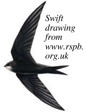
Swift drawing from www.rspb.org.uk

T HEY'RE BACK AGAIN – our swifts – coming back to nest on our roof. All the way from southern and equatorial Africa to Perrycroft Road. Every year, man and boy, for the past twenty years or so. Marvellous. May 4th this year, a day later than last year. They make my summer! They fly back to Africa with their young in August. What a journey. What a bird! Amazing aren't they?