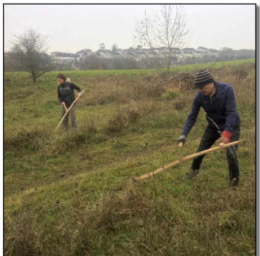
Wildlife friendly hay cutting