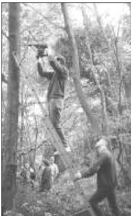
A standard British workforce in action - one worker, one holding the ladder and three others watching/chatting