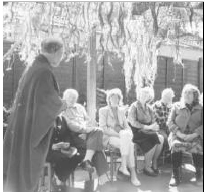
The Principal in his academic gown (and full flow). The photo is of an earlier event - the matinée française