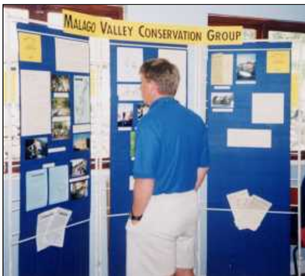
Fun on the Farm

do, of course, is sell copies, so if you have any ideas for marketing, please give me a ring.