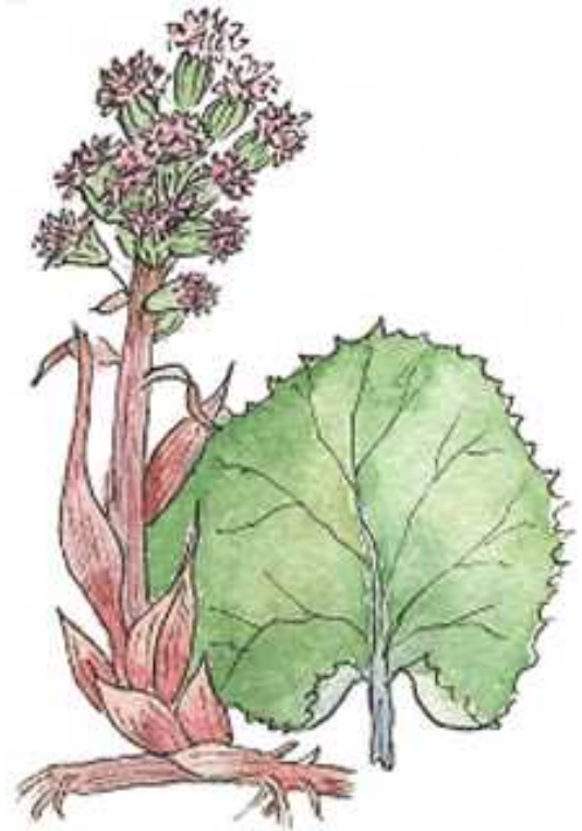
Lola's drawing of butterbur from 'My Manor Woods Book'.

However, we also saw some serious pollution in the Malago - not only was the water grey, but there was white foam where it went over the weirs. This prompted a phone call to the Environment Agency's hotline on 0800 807060, where a real-live human rather than a voice-mail system answered and promised a call-back - which duly came. Whenever you see pollution, don't hesitate to use this free number.