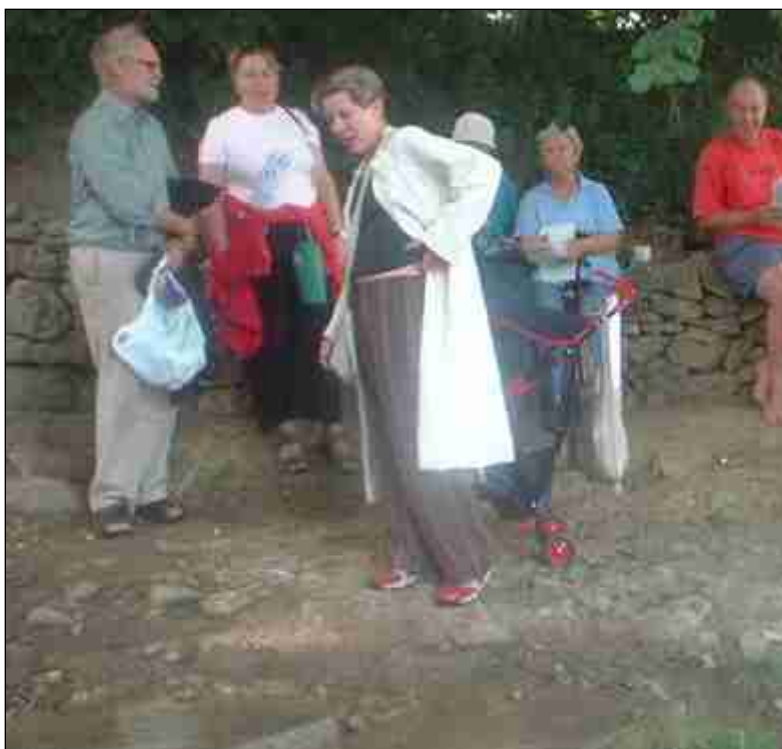
At the Malgo Spring artwork - with the artist he