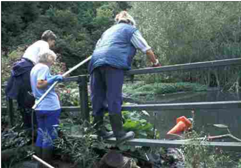
Several that didn't get away

The usual fun and games at this year's Amphibious Garbage Raid. Only three or four big items, and they went straight to the tip. Where the dozens of cans came from is a bit of a mystery - not to mention the safe with back ripped open!